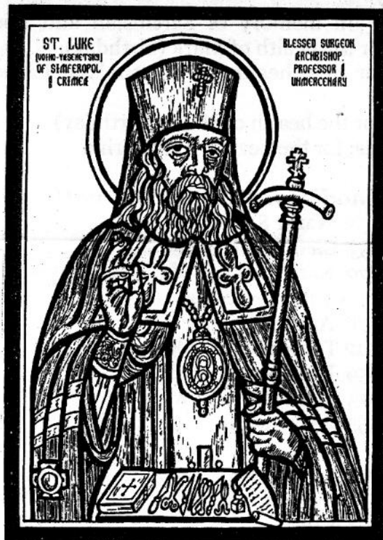
Instructions of St. Luke

Every time before Christ healed someone, he asked if he believed. And only if he believes, He performed the miracle.