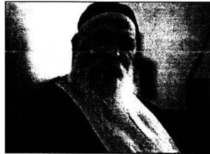
FROM THE COUNSELS OF ELDER PHILOTHEOS OF PARA

9:10a.m. Hours; 9:30a.m. Divine Liturgy Coffee Hour; Teen Class