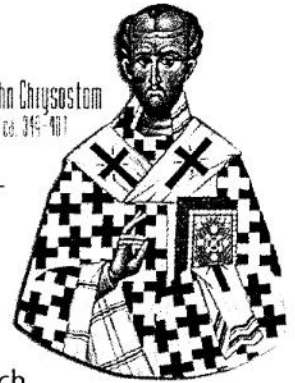
John Chrysostom ca. 349-407

Just as a calm and sheltered harbor provides great security to the ships moored there, so does the temple of God: when people enter it, it snatches them away from worldly affairs as from a storm, and gives them the capacity to stand and listen to God's words in calm and security. This place is the bedrock of virtue and the school of spiritual life...You need only set foot on the threshold of a church and at once you are liberated from the cares of daily life. Go on into the church, and spiritual dew will envelop your soul. The stillness there moves you to awe, and teaches you how to live spiritually. It elevates your thoughts and prevents you from remembering things or matters belonging to the present life. It transports you from earth to heaven. And if there is such great gain from simply being in church when no service is going on, then how much benefit will people derive from being present...when the holy Apostles proclaim the Gospel, Christ stands in our midst, God the Father receives the Mysteries that are performed and the Holy Spirit gives His own joy.