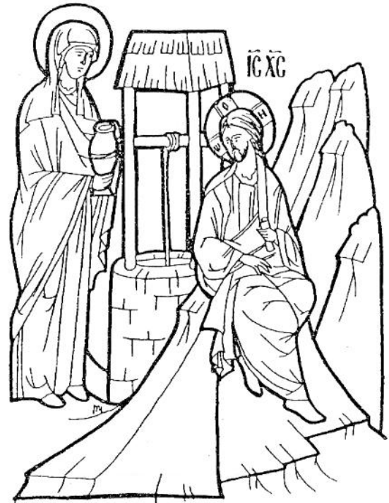
THE SAMARITAN WOMAN

9:10a.m. Hours; 9:30a.m. Divine Liturgy Coffee Hour