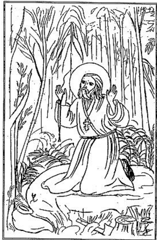
SAINT SERAPHIM WONDERWORKER OF SAROV