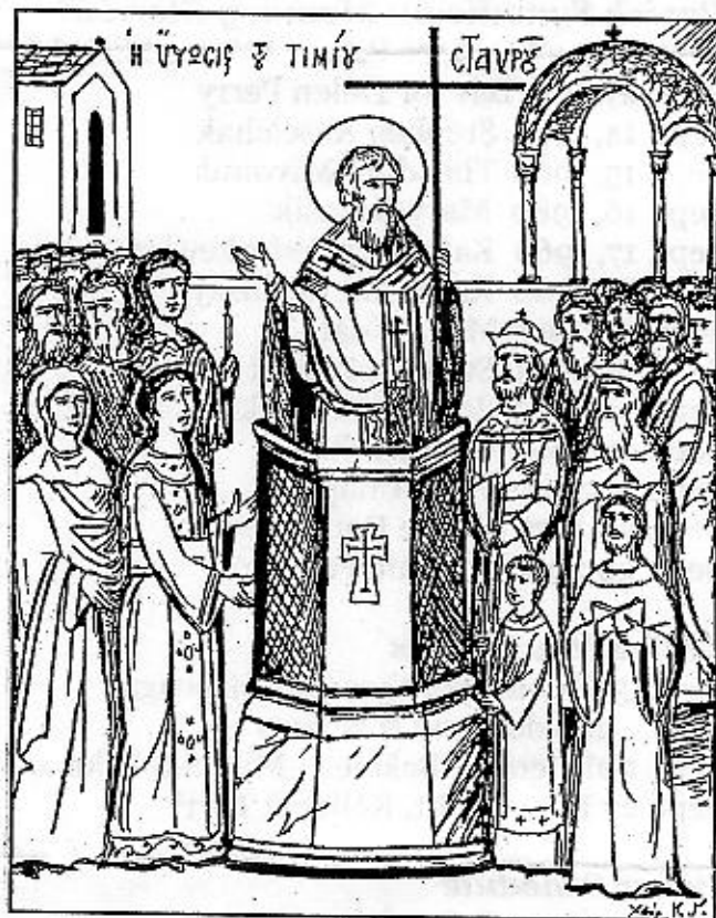
The Elevation of the Cross