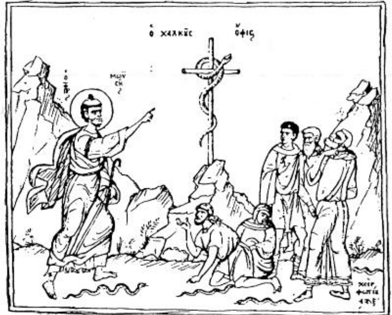
"The Brazen Serpent"

The brazen or bronze serpent lifted up on a pole by Moses in the desert (Num. 21:8-9) is everywhere recognized by the Fathers as "a type of the passion of salvation accomplished by means of the Cross" (St. Basil, On the Holy Spirit , 14). St. Cyril of Jerusalem writes in his Catechesis (XIII, 20),