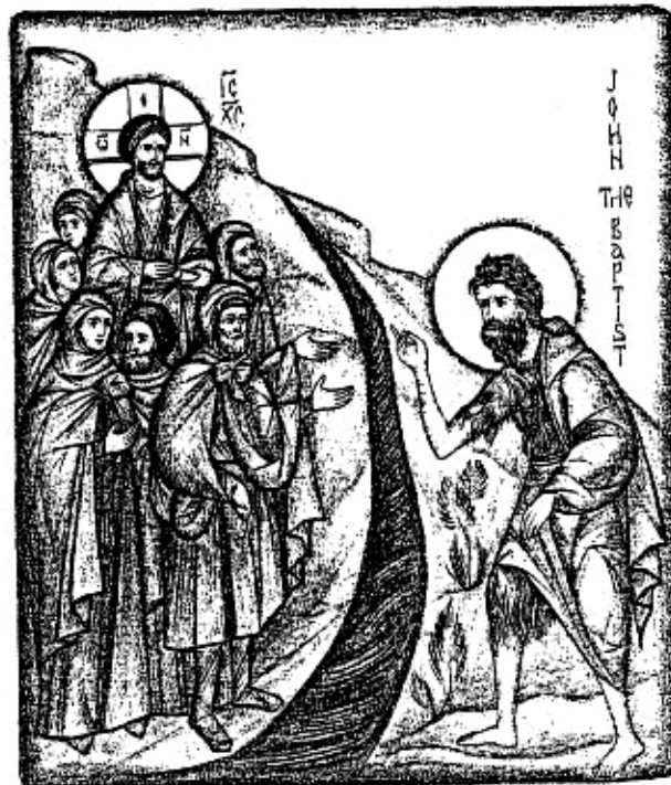
John the Baptist pointing witness to Christ.