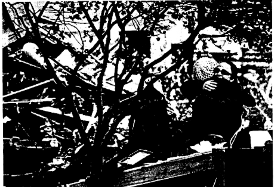
Two women embrace outside a home destroyed by storm surge flooding on hard-hit Staten Island in New York City following Hurricane Sandy. Through your generous support, IOCC is reaching out to storm survivors along the East Coast with desperately needed food, water, blankets and trauma counseling.

To the north in Toms River, New Jersey, IOCC Frontliners joined members from local chapters of AHEPA (American Hellenic Educational Progressive Association), and women's philanthropic society, Philoptochos, to assemble and distribute emergency clean-up buckets to more than 150 local residents trying to salvage their wind and water-damaged homes.