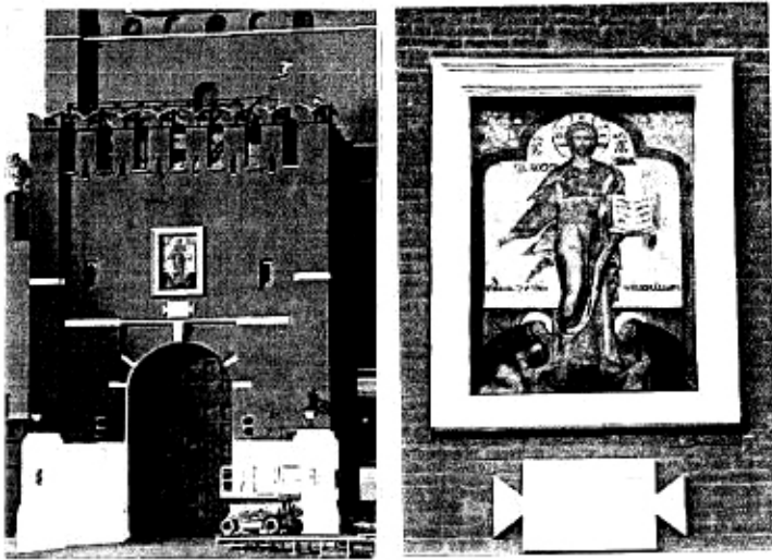
The Kremlin's Savior Tower now bears the restored icon of the Savior, concealed since Stalin's time.