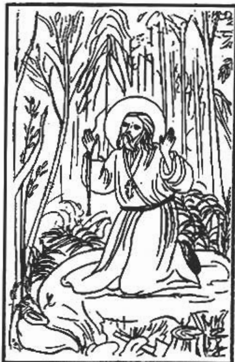
1000 days and nights on the rock in prayer.

In the deep forest there was a huge rock. The saint began a God-pleasing toil here, in the manner of the ancient saints. The great elder spent 1000 nights and days on this rock, his hands upheld, praying to God with compunction. Day and night he whispered the prayer: "God, be merciful to me, a sinner!" Neither animals, nor evil people, nor winter cold and wind—nothing frightened Father Seraphim, for the Lord and God's angels were with him.