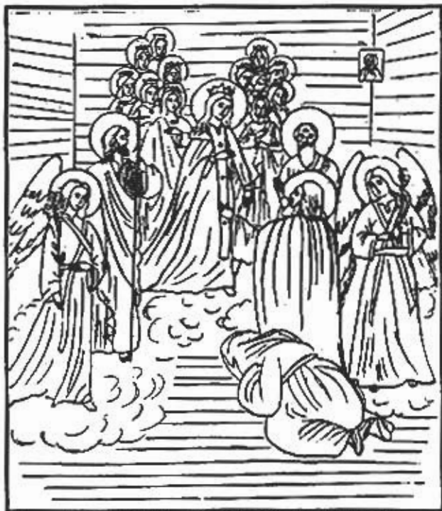
Accompanied by saints, the Mother of God comes to St. Seraphim shortly before his repose.