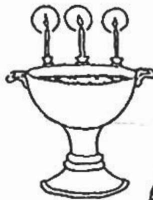
Kettle of Holy Water

9:10a.m. Hours; 9:30a.m. Divine Liturgy Coffee Hour; Church School; Teen Discussion