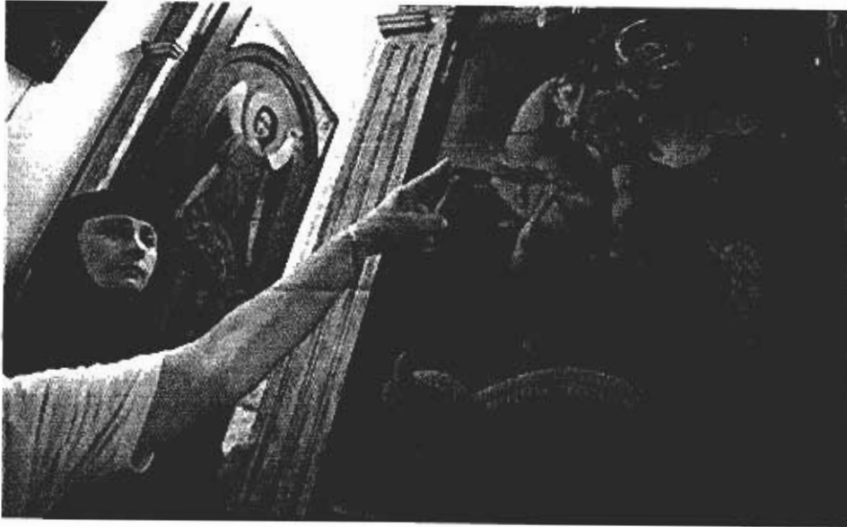
A Greek Orthodox nun looks at a painting of St. George, at a church in Ramle, central Israel, Tuesday, June 9, 2009. Christians have been flocking to this heavily Muslim suburb of Tel Aviv for two days to see what local Christians are calling a miracle, streaks of what looks like oil mysteriously dripping down an icon of St. George, at a Greek Orthodox church named for the 3rd century saint.