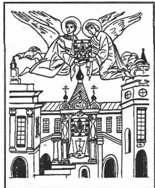
Current residence of the Kursk Icon: the Cathedral of the Sign, New York City, USA.

As an invincible wall and source of miracles, you servants have you O most holy Theotokos. For having over come the enemy, you intercede with Christ God to grant peace to our land and great mercy to our souls.