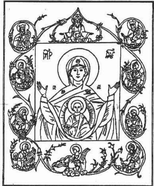
The Wonderworking Kursk Root Icon