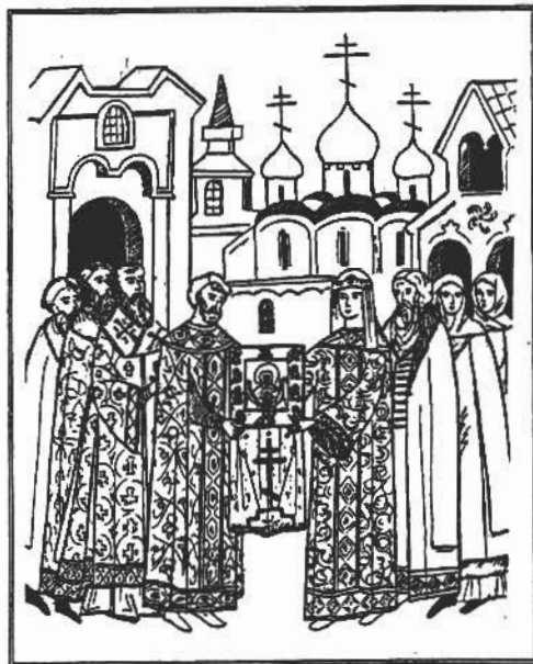
Tsar Theodore and Tsaritsa Irene beautifully adorn the Kursk Icon of the Mother of God.