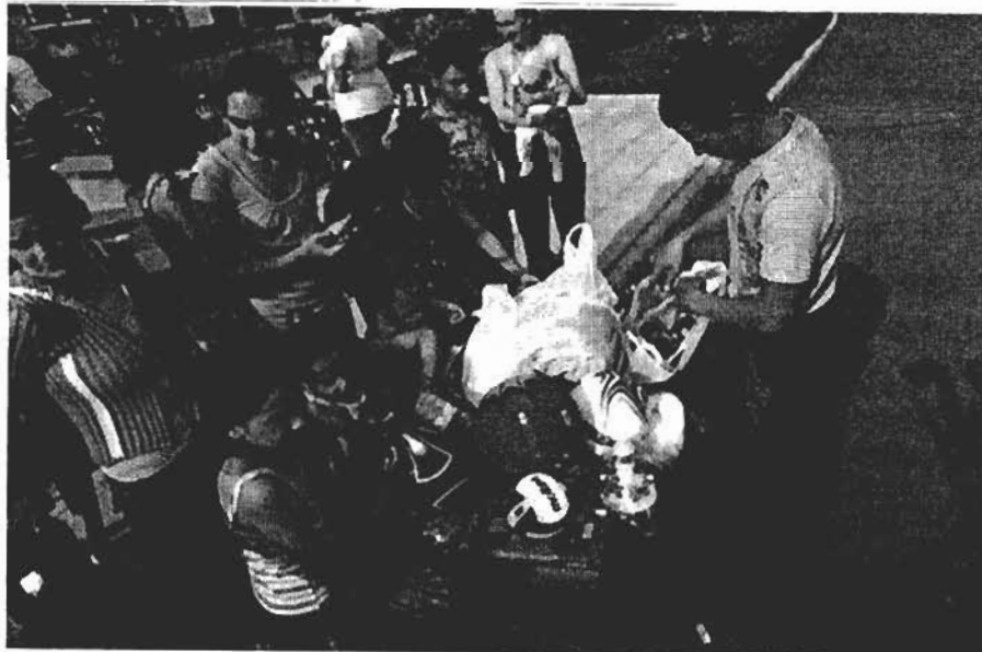
Families who fled the conflict in South Ossetia receive hygiene supplies and other items from IOCC. The families are staying at a women's monastery in North Ossetia, the Russian Federation.

IOCC began providing assistance to displaced persons in and around Tbilisi on August 13, assisting more than 1,000 individuals in three distributions. The displaced families included South Ossetians, ethnic Russians, and Georgians. IOCC will expand its assistance to other parts of the country that are receiving less assistance than the capital.