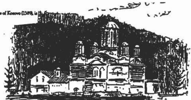
Revanica monastery, built by Tsar Lazar just before the Battle of Kosovo (1389), is the largest Serbian Orthodox monastery near Caprija in Kosovo.

That's why I dissent on this global rush to welcome Kosovo into the community of nations.