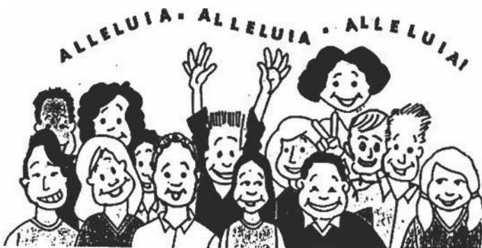
Alleluia is a joyful song of praise to God. The word Alleluia is also used as a sign of the presence of God. Whenever we sing Alleluia we announce that God is here with us.

Has posted any changes that would take place to the monthly or weekly calendar. It is continually updated as need be. Check, "Schedule of Services."