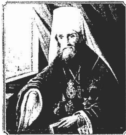
Teach Me to Pray Saint Philaret of Moscow

My Lord, I know not what I ought to ask of Thee. Thou and Thou alone knowest my needs. Thou lovest me more than I am able to love Thee. O Father, grant unto me, Thy servant, all which I cannot ask. For a cross I dare not ask, nor for consolation; I dare only to stand in Thy presence. My heart is open to Thee. Thou seest my needs of which I myself am unaware. Behold and lift me up! In Thy presence I stand, awed and silenced by Thy will and Thy judgments, into which my mind cannot penetrate. To Thee I offer myself as a sacrifice. No other desire is mine but to fulfill Thy will. Teach me how to pray. Do Thyself pray within me. Amen.